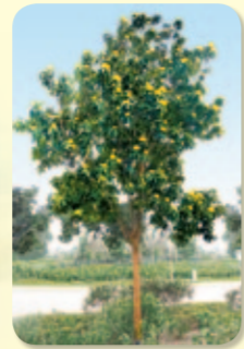
金蒲桃 Golden Penda