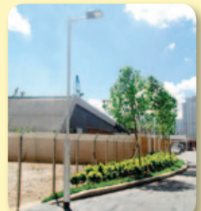
節能LED街燈 LED Street Lights

All along, landscaping, greening and sustainable designs are priorities of the KTD projects, and the stage 2 infrastructure works at the former north apron area follow this principle to create a harmonious environment throughout the development area. In particular, the pedestrian streets are designed to echo the podium-free, medium and low rise blocks disposition with beautiful courtyards design concepts of the Grid Neighbourhood for a well-balanced and interesting vista to enhance community interactions. The retail belt of the Grid Neighbourhood facing the Station Square is intended to feature a colonnade architectural arrangement that will provide a comfortable covered walkway for pedestrians and help to bring back the street ambience of the old Kowloon City. LED street lights and specially designed paving also added value to the green credentials and visual effect.