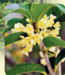
桂花 Fragrant Olive

位於第二期基礎設施內的路旁美化市容地帶，為市民提供一個靜態的康樂休憩空間，並會以同樣的「簡約優雅」為園景主題。其中秋楓樹高大挺拔，小花朵黃中透綠，行人漫步樹下倍感悠然舒爽；灌木方面，風雨花在春秋期間將開滿漏斗形白色花朵；此外，散發濃郁杏果或蜜桃香氣的桂花，美化路旁景致。