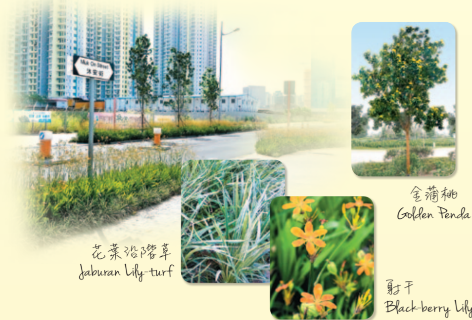
花葉沿階草 Jaburan Lily-turf