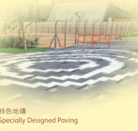
特色地磚 Specially Designed Paving

啟德發展區內的不同項目一直以園景美化、綠化和可持續發展設計為優先考慮。前北面停機坪第二期基礎設施工程同樣貫徹這個原則，務求與發展區和諧相融。當中，行人專用街道在園景和綠化上的設計匠心獨運，以配合「啟德坊」不設平台、以中低座布局及附設宜人庭院的設計原則，營造一個布局錯落有致、鄰里和諧的住宅專區；「啟德坊」面對車站廣場的商用設施將採用柱廊設計，以建造舒適的有蓋行人通道，並帶出昔日九龍城的街道氛圍。此外，節能LED照明街燈和在行人專用街道上鋪設的特色地磚更可增添環境綠化和視覺效果特色。