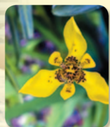
黃花巴西鸚尾 Yellow Walking Iris