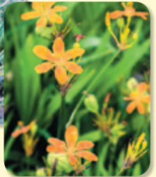
射干 Black-berry Lily

圍繞「啟德坊」的沐寧街和沐安街為新建區內道路，以「簡約優雅」的綠化主題，配合兩旁井然有序的喬木與柔和雅致的植物形態，營造出區內道路明顯的連貫性與獨特個性。作為主題樹的金蒲桃，全年均綻放金黃花朵。此外，路旁的射干，由盛夏至初秋將開滿橘黃並帶紅色斑點的小花；而覆蓋地面的花葉沿階草，則綻放呈鐘形的嬌嫩細小白色花叢，增添繽紛色彩。