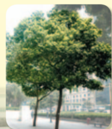
陰香 Padang Cassia