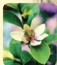
含笑 Banana Shrub

The pedestrian streets connecting the six residential sites in the Grid Neighbourhood adopt the greening theme of “Coming Home”, which is characterised by planting of ample trees in proportion to human scale and shrubs, layers of greenery, and carefully matching of flower varieties to create a quiet and comfortable ambience. Shaping this scenic landscaping is evergreen Padang Cassia tree with aromatic bark and small yellow flowers that bloom in early summer; shrubs like the Yellow Walking Iris with sword-like foliage that has yellow flowers mottled with brown spots; and the Banana Shrub with distinctive sweet banana-scented creamy yellow flowers that burst forth from late spring through summer.