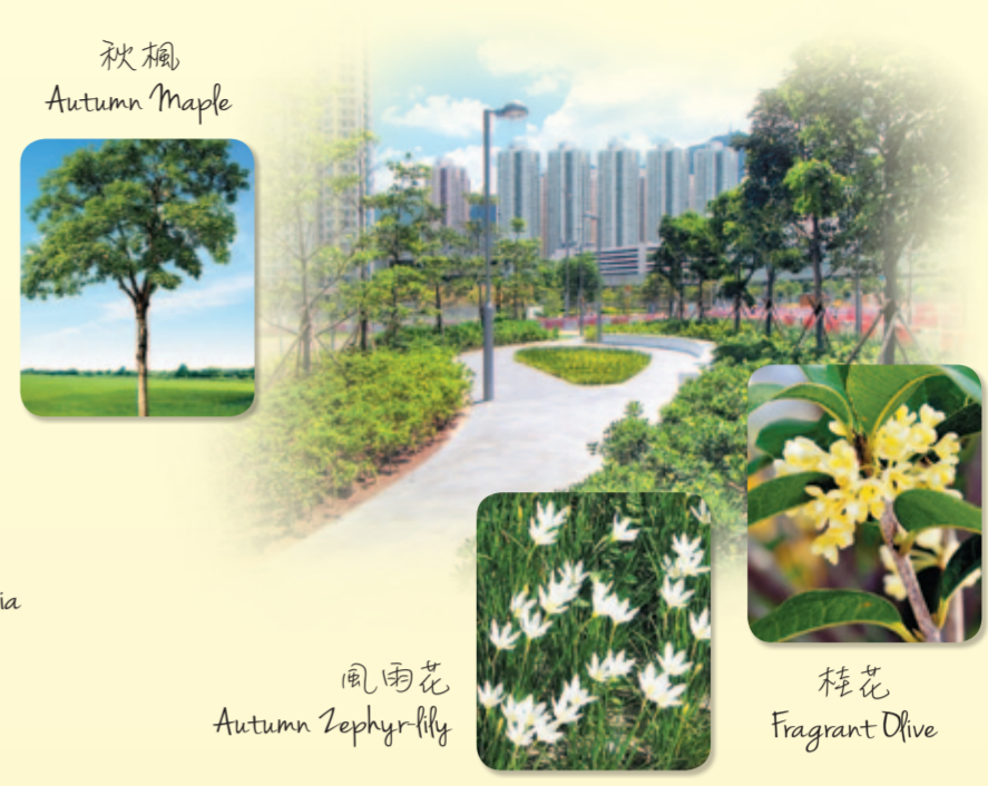
秋楓 Autumn Maple